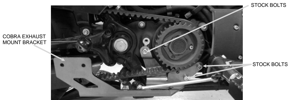
FIGURE 1 Continued on Page 2

* Cobra® recommends you always wear a helmet while riding. Please never operate your motorcycle while under the influence of alcohol and/or drugs. Enjoy the new look of your motorcycle and please ride safely.