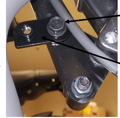
RIGHT-SIDE UPPER BOLT