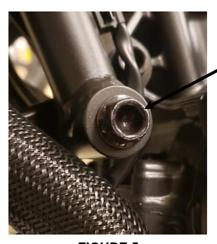
LEFT-SIDE LOWER BOLT