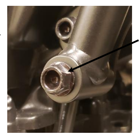
RIGHT-SIDE LOWER BOLT