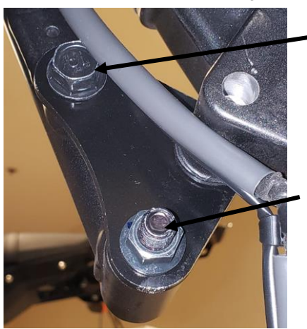
RIGHT-SIDE UPPER BOLT