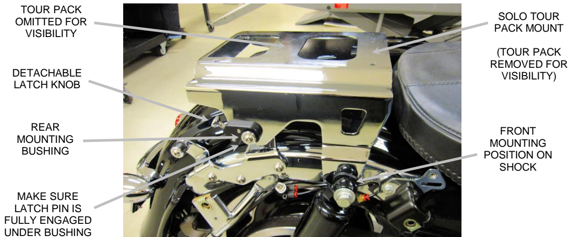
FIGURE 3, TOUR PACK MOUNT INSTALLED

*** DO NOT *** EXCEED THE MAXIMUM WEIGHT CAPACITY OF THE TOUR PACK MOUNT, MAX. WEIGHT CAPACITY INCLUDES TOUR PACK AND CONTENTS = 25 POUNDS.